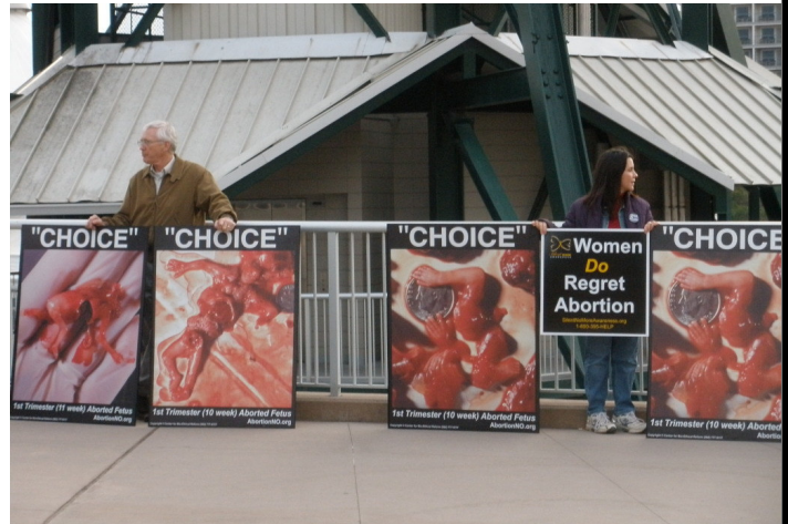
"Choice" signs prove that even first-trimester abortion is an act of violence that kills a human baby. Here we are outside a Planned Parenthood fundraiser. (Story on next page.)

"I am 29 years old woman. I am pregnant. This pregnancy was not at all planned. I considered to abort the pregnancy. I went to Google and I found your web-pages. Thank you for these web-pages. Thank you that you were along to save my child's life. I am not able to kill my child. I am even not sure who the father is, but one thing is clear. This baby will have the same loving mother as my first two children. Tears flow freely when I watch small hands and legs. My child must not be hurt. I have asked the baby to forgive me... I wish I will be forgiven. I have promised to try my best, that the baby will have a happy life with me, because he has begun life."