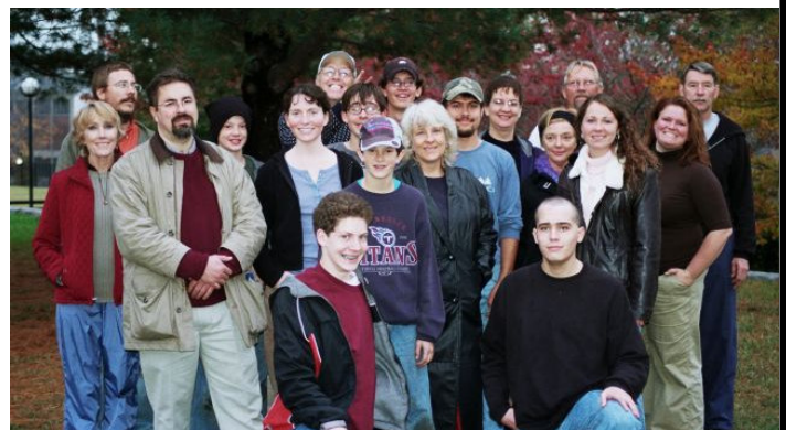
This company is ready to go. As a stockholder in our work, your investment puts this team on the road again!

Seeing makes a difference. (female student)