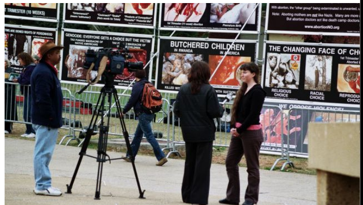
Media coverage only magnifies the influence of the GAP display.