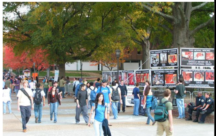
A great location guaranteed that thousands of students saw the facts of prenatal development and abortion.

If you aren't yet on the team, please consider supporting our work on a monthly basis. Another baby's life is at stake.